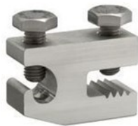
ILSCO SGB - 4 Grounding Lug