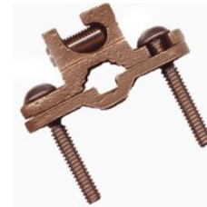
Armored Ground Clamp