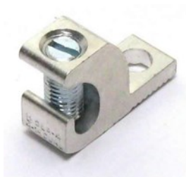
ILSCO GBL - 4B Lay-in Lug