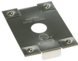
Washer, Electrical Equipment Bond - WEEB