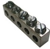
Grounding Bus Bar