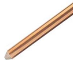
Ground Rod - 5/8" x 8' Copper