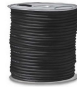
USE -2 or PV Wire