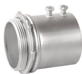
Set-screw Connector (Indoor)