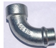
Telephone Sweep/ Elbow Connector