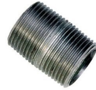
Threaded/ Closed Nipple/ Chase Nipple