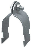
Strut Pipe Clamp