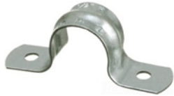
2 Hole EMT Strap