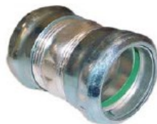
Rain-Tight Compression Connector