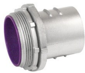
FMC Screw-in Connector