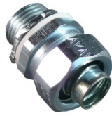
LT Flexible Non-metallic Connector