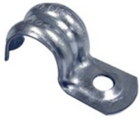
1 Hole EMT Strap