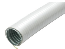
“Liquid-Tight” Flexible Metal Conduit