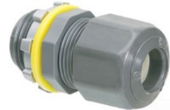
Non-metallic Cord Grip/ Strain relief