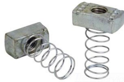
Spring Strut Nut