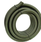
Flexible Metal Conduit (FMC)