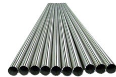
Electrical Metal Tubing/ Conduit (EMT)