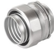
LT Box Connector