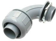
LFNC 90 Degree Connector