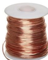
Bare Copper Wire: #6 & #8