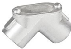
90 Degree Pulling Elbow