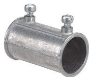
Set-screw Coupling (Indoor)